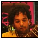
Co-founder and CEO, Beatoven.ai