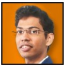
Co-founder and CEO, Fluid AI

Join us to explore the exciting intersection of art and technology and take a glimpse at the works of artists and technologists who are pushing the boundaries of what's possible in tech-art.