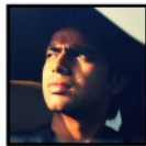
Indian Sci-Fi Creator, Screenwriter, and VP of Development, BANG BANG Mediacorp