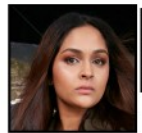
Creative Director, Tao Art Gallery