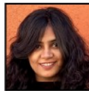
Founder, Maker's Legal