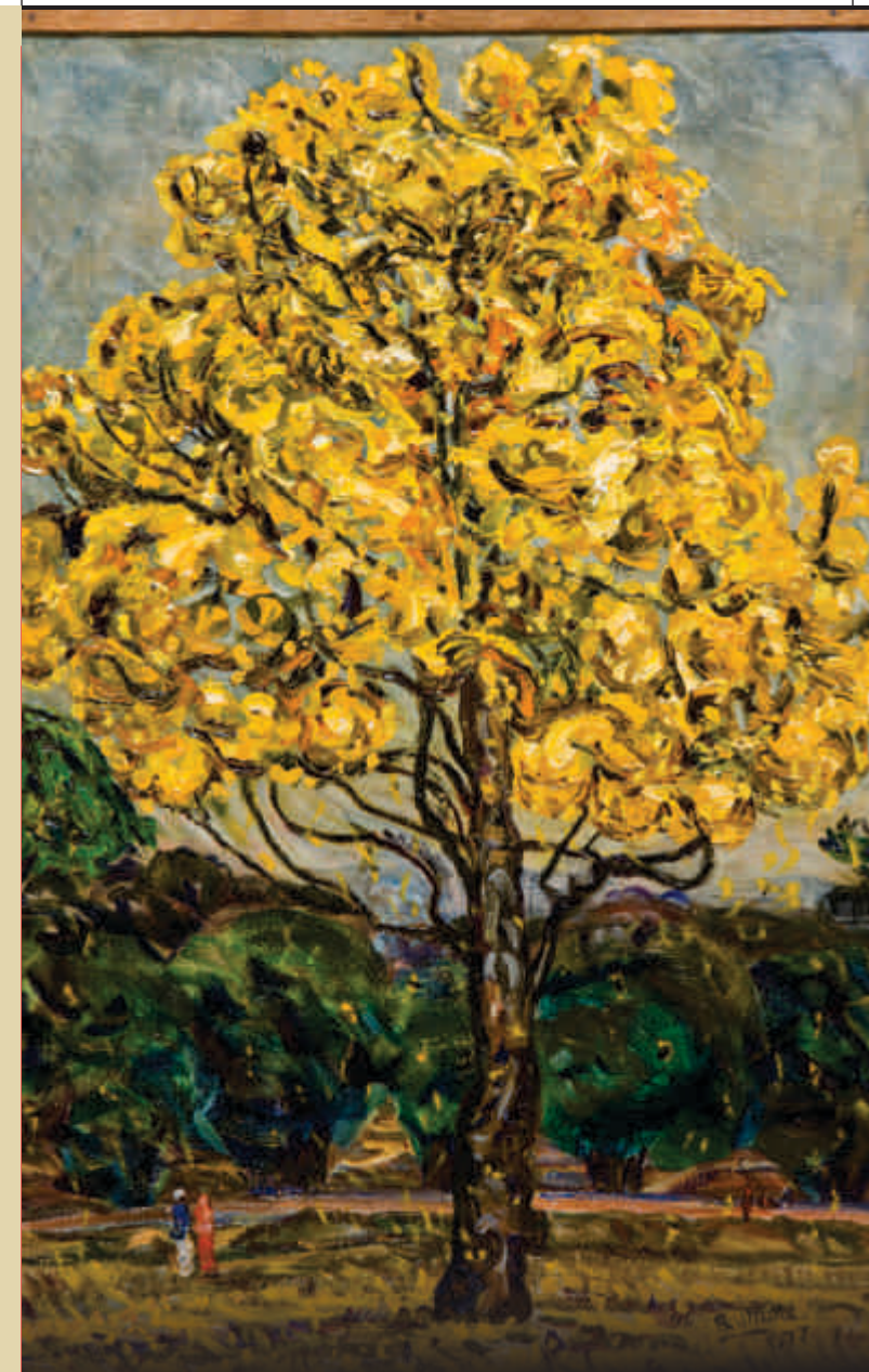
Yellow bloom, Cubbon Park, 1977 Oil on canvas

Timing: Open daily 10 am to 5 pm Galleries, museum shop, public art reference library, cafeteria Closed on Mondays and National Holidays